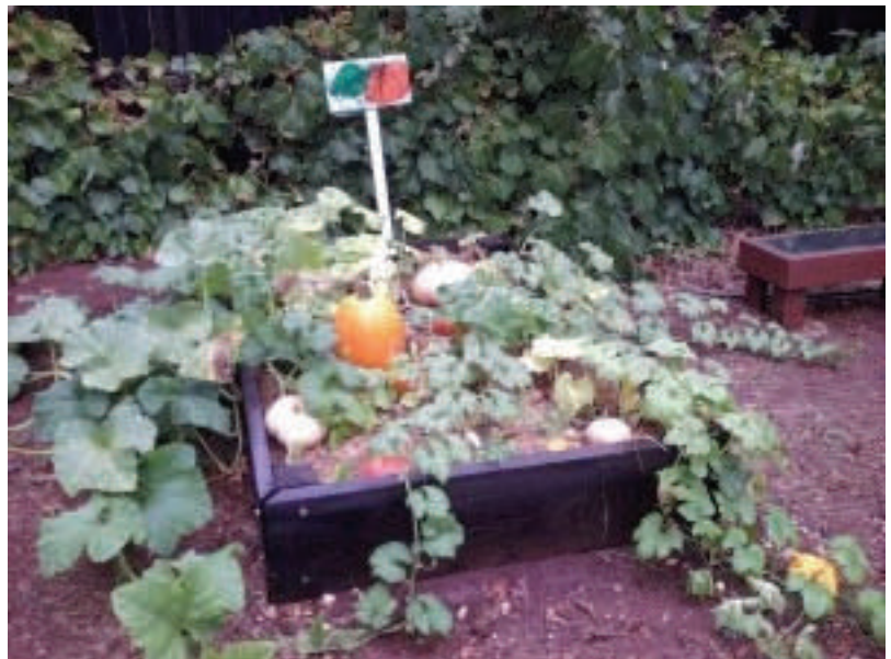
KARE Volunteers 2011 Pumpkin Patch